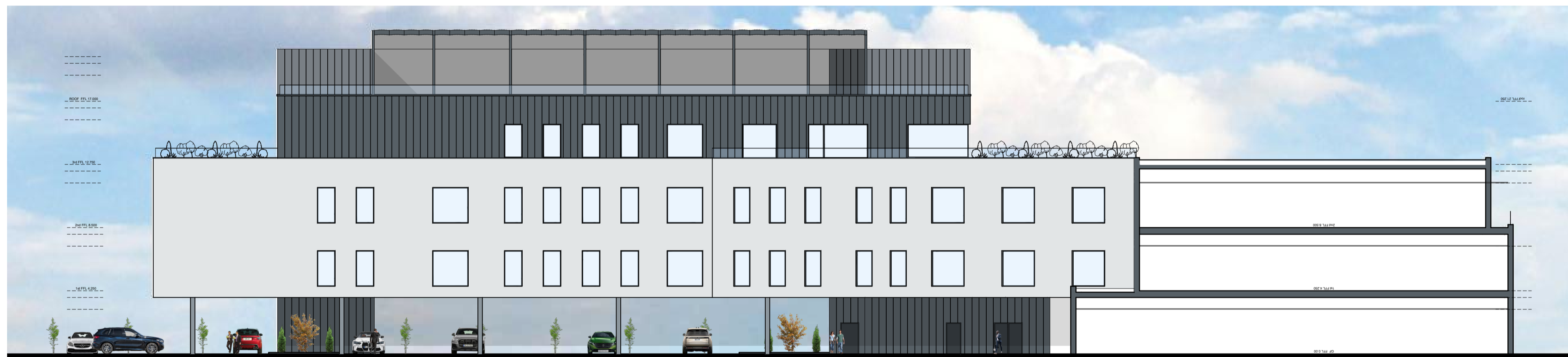
SECTIONAL ELEVATION A