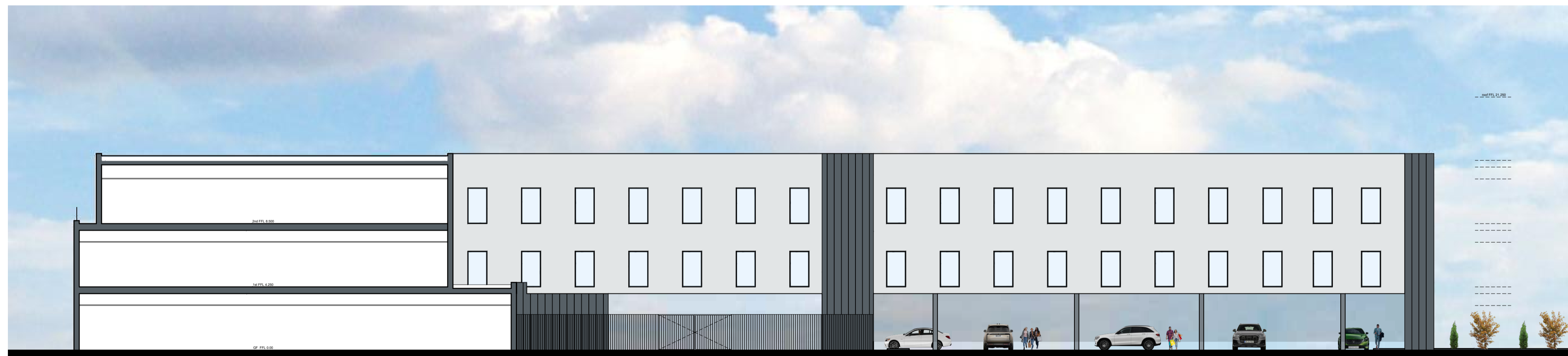
SECTIONAL ELEVATION B